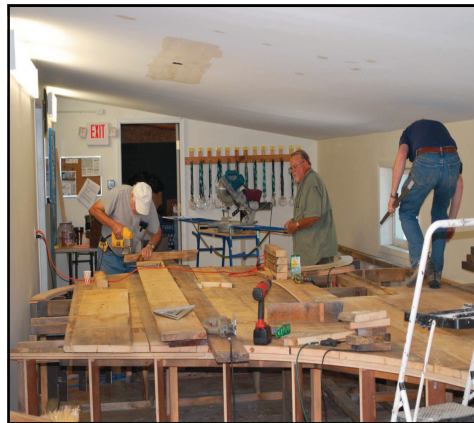
The "G" group. Hard at work.