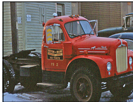
One of the 14,000 + photo's in our collection.

"If you are doing research on anything pertaining to railroads, check with us. There is a good chance that we will have something useful. All items are cataloged and on our computer, and most items can be checked out for 30 days."