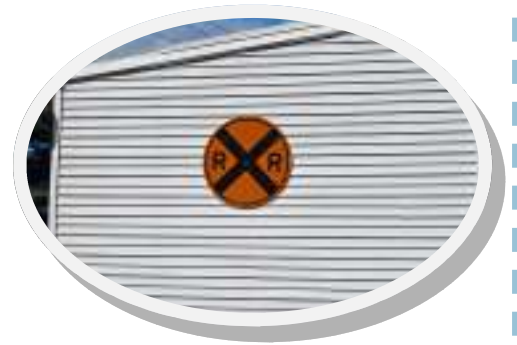
Tom Coulombe and Jerry Johnston installed this sign the other day.

woods and is not visible from the road. The part of the driveway which joins the main road is not tarred, but the upper part of the driveway (not visible from the main road) is tarred. The mailbox is clearly marked.