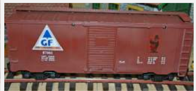
G scale box car that will be presented to Governor's Restaurant on August 20.

Club members set up their campsite at the west branch of