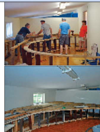
Working on the "G" scale benchwork.