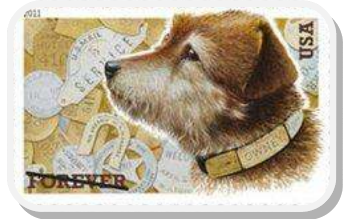
Owey the postal dog, coming to your post Office on July 27, 2011.