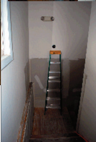
The head of the new stairway