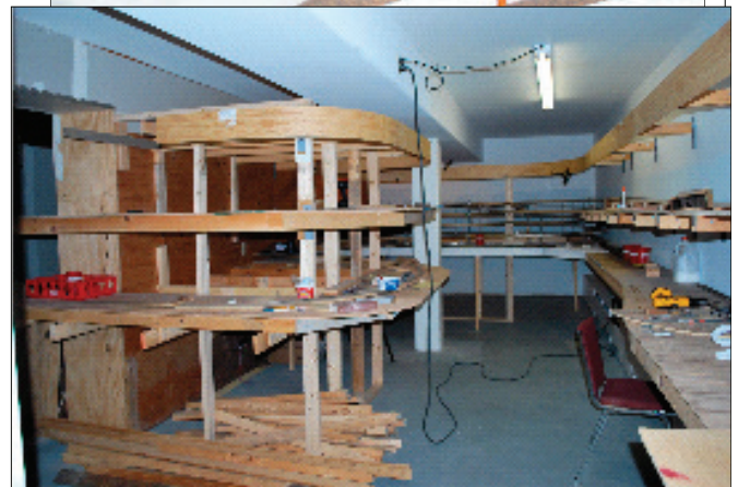
Yes that is track that you see! Work is progressing on the layout and there is always something to do if you want to help.

Here are some pictures of the work being done at the club. There is not enough space to show you everything.