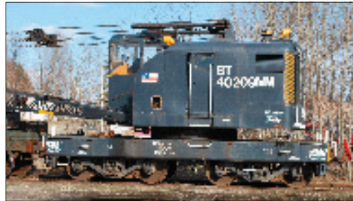
ST crane at Winthrop ME in April 2009.