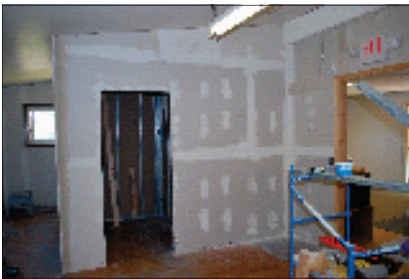
Above and to the left is the new closet at the head of the stairs.

"Stop in and check out a book on Wednesday nights, Saturday mornings, or meeting nights. You can keep a book for thirty days. This is just another benefit of your membership."