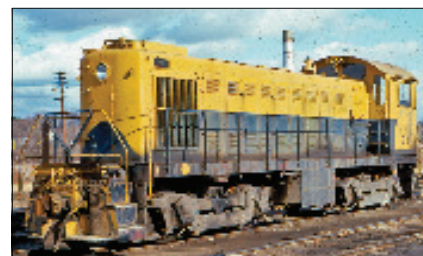
BAR scans (See page four.)