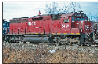
A Pan Am rental unit in Greene on 2/15/10

“For your $150 you get five years’ paid dues; an HO layout section (worth $25 to $50) for your home layout; and a $25 tax-deductible donation to the club (split between HO layout costs and general operations of the club). That’s five years’ regular membership dues, a layout section and a $25 donation to the club. This offer is only available to the first two members who decide to take advantage of this opportunity.”