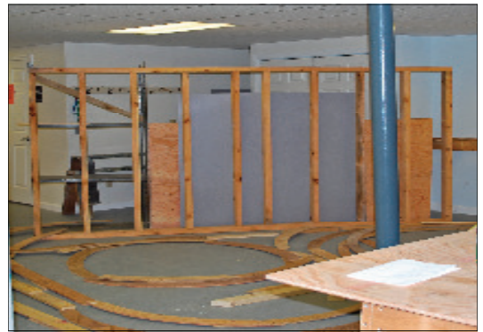
Future Passenger Yard Area.