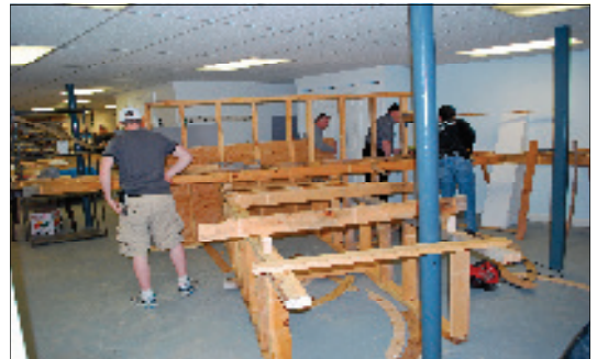
The Building Crew Hard at Work.