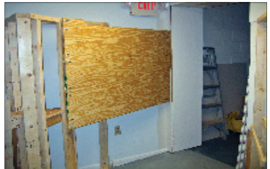
Furnace Room Gate Area