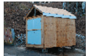
Our new shed is taking shape.