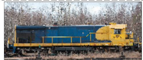
MM & A power at Northern Maine Junction in November.

Don’t forget that we are working on the building every Wednesday night starting at 6:00 p.m., and Saturday Mornings at 9:00 a.m.