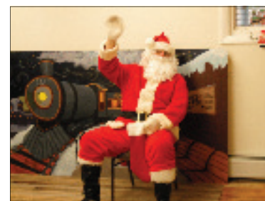
Santa at the club, during ExTRAINaganza.