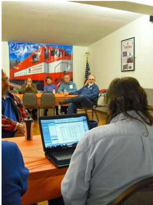
Operation Life Saver.

Club members need to leave parking spaces around the building for our guests. We can park at Goodman’s next door when they are closed on Saturday