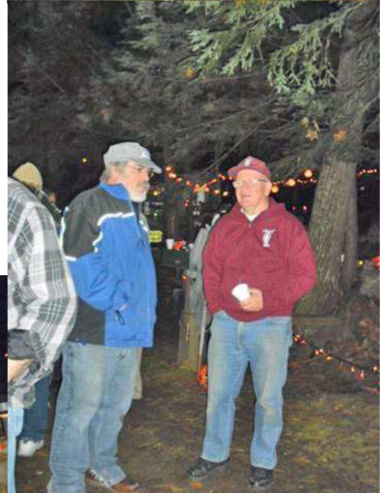
Halloween at Dick Clark's