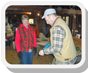
Set-up at McLaughlin Gardens'