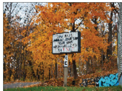
participate in fund-raising for the club's HO layout.

Let's get on track and get this railroad built!