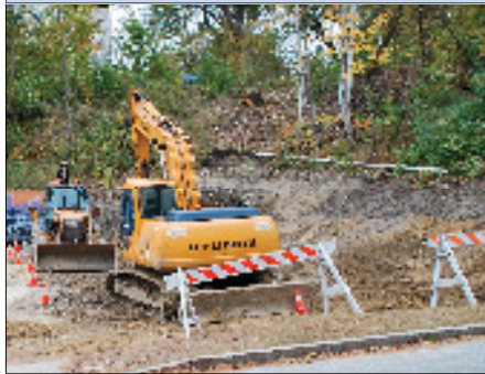
Left, just starting. Right, almost done.