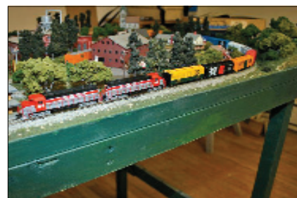
N-scale layout at the club.

This article is an introduction to the fund-raiser. Next month an envelope will be mailed to those who receive the newsletter so that members who do not attend meetings can partici-