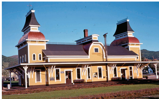
Conway Scenic Railroad Station, before restoration and after. Pictures from our Kingston collection.