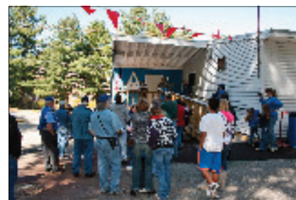
Steve Martelli giving dedication speech.

Three televisions in different sections of the building showed varying aspects of the club's activities. Operation Lifesaver railroad safety videos were a hit. Another television featured programs from TRAIN TIME , the half-hour show produced by the Great Falls Model Railroad Club for local cable channels throughout the state. Just inside the entry to the building, a third television presented a show about the club. A bulletin board near the television featured newspaper clippings publicizing club activities. Railroad safety materials and club handouts were available on the table. Also on the table was a framed letter from Senator Olympia Snowe, congratulating the club on its accomplishments and contributions to